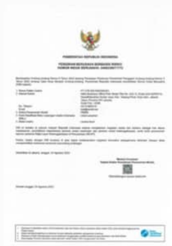
Manpower Agency`s License