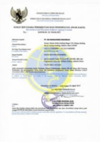
Seafarers Agency`s License